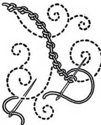
Double knot stitch

Heart can be made larger or smaller. Work the design in the same way.